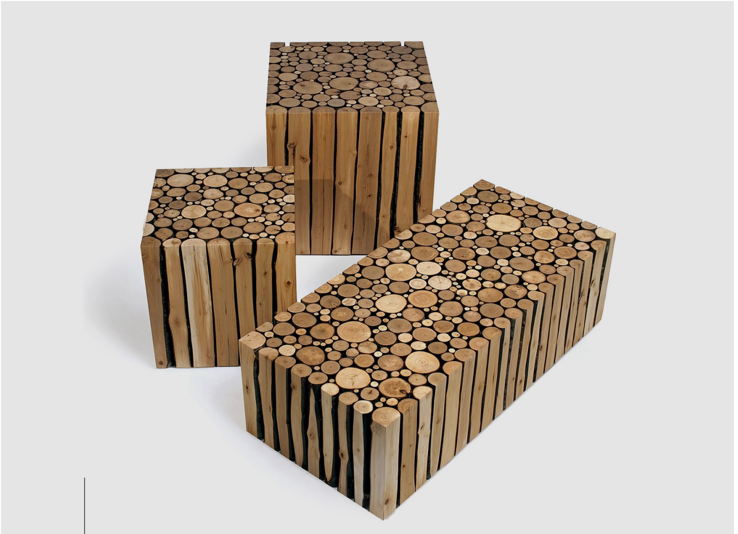
ALDER TABLE | Red Alder, Clear Varnish | Various Sizes