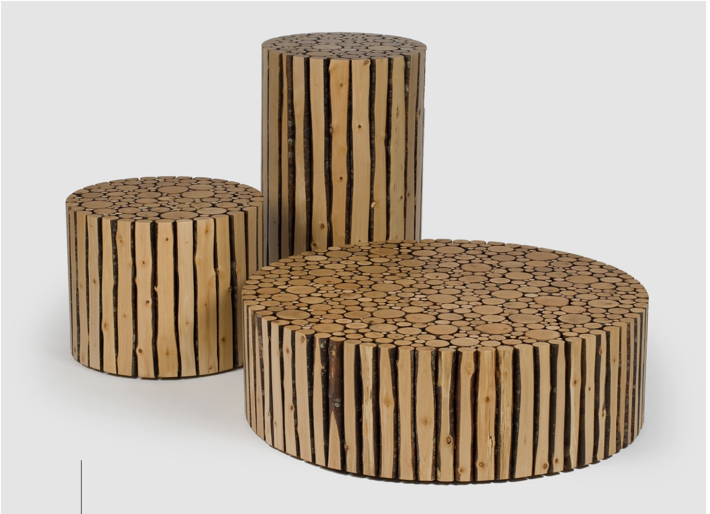
ALDER ROUND TABLE | Red Alder, Clear Varnish | Various Sizes