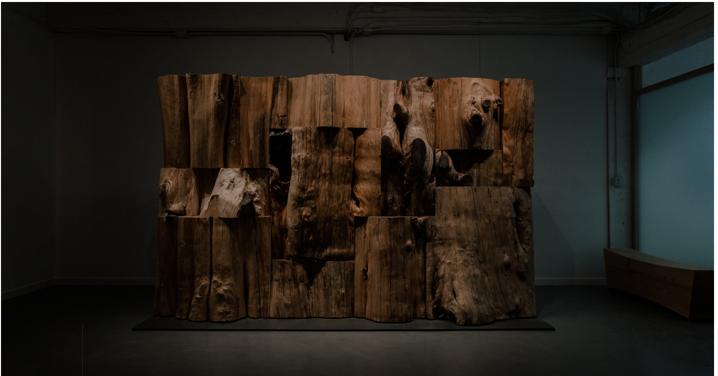
G-1 | GARRISON | Western Maple | 135" x 48" x 85"H

The Garrison was built from discarded material that is not highly valued by the lumber industry. The bulbous, swirling knots, twisting grain and decaying hearts that are so prominent in this piece render the wood unmarketable. Consequently, many people are unfamiliar with wooden objects possessing these natural “flaws”. Yet, they are common to all trees just as unique personality traits are common to all people, signifying our individual characters.