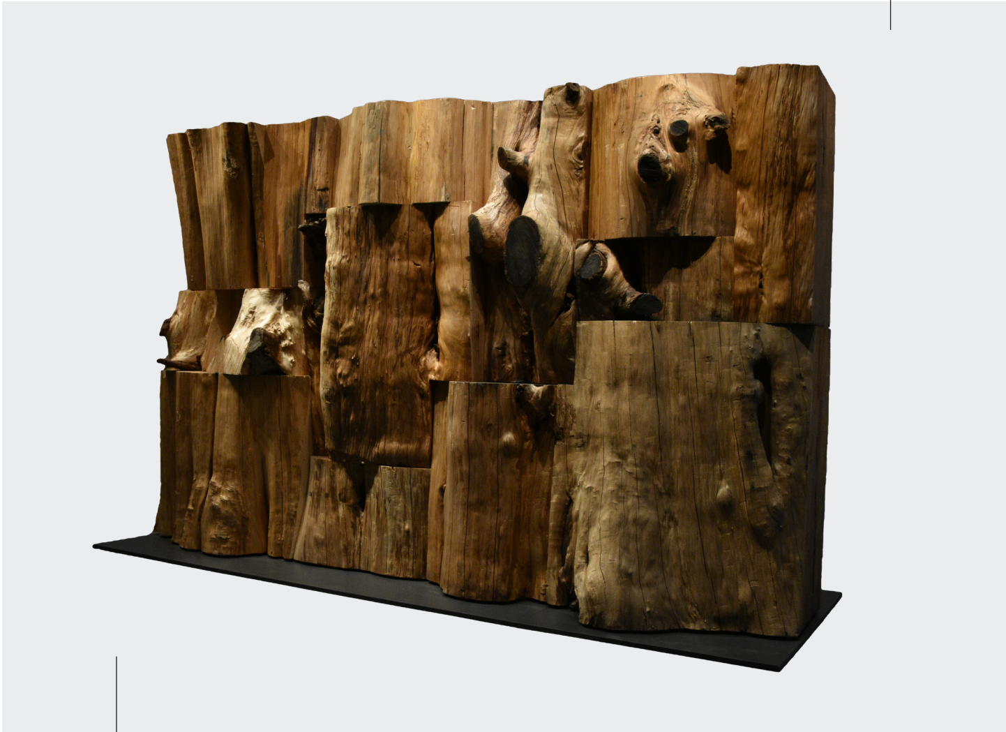
G-1 | GARRISON | Western Maple | 135" x 48" x 85"H