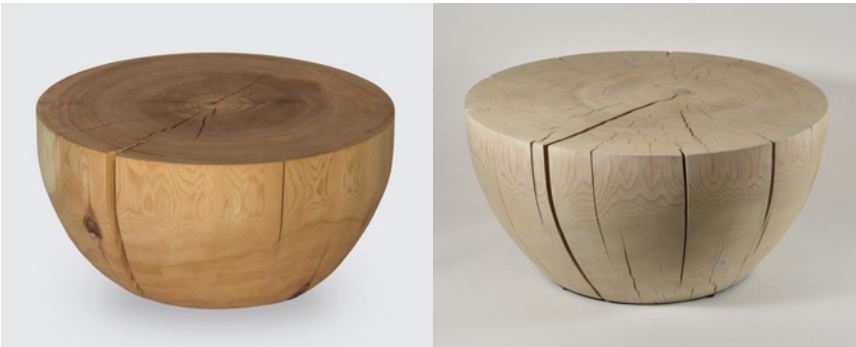
Acceptable range of profile variation on a DR-1L Drum

Each piece is hand carved from natural material and subject to variation from photos, illustrations, and floor samples. Dimensional tolerance varies by product but expected to fall within +/- 1/2" for solid wood pieces.