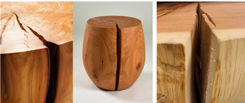
Examples of typical checking in a finished piece as a result of the drying process

In the event that a crack widens enough to expose rough, unfinished material, contact Brent Comber Originals for a touch up repair kit and detailed instructions. This is a straight forward repair: remove any loose material, lightly sand inside the crack, and apply finish to the area.