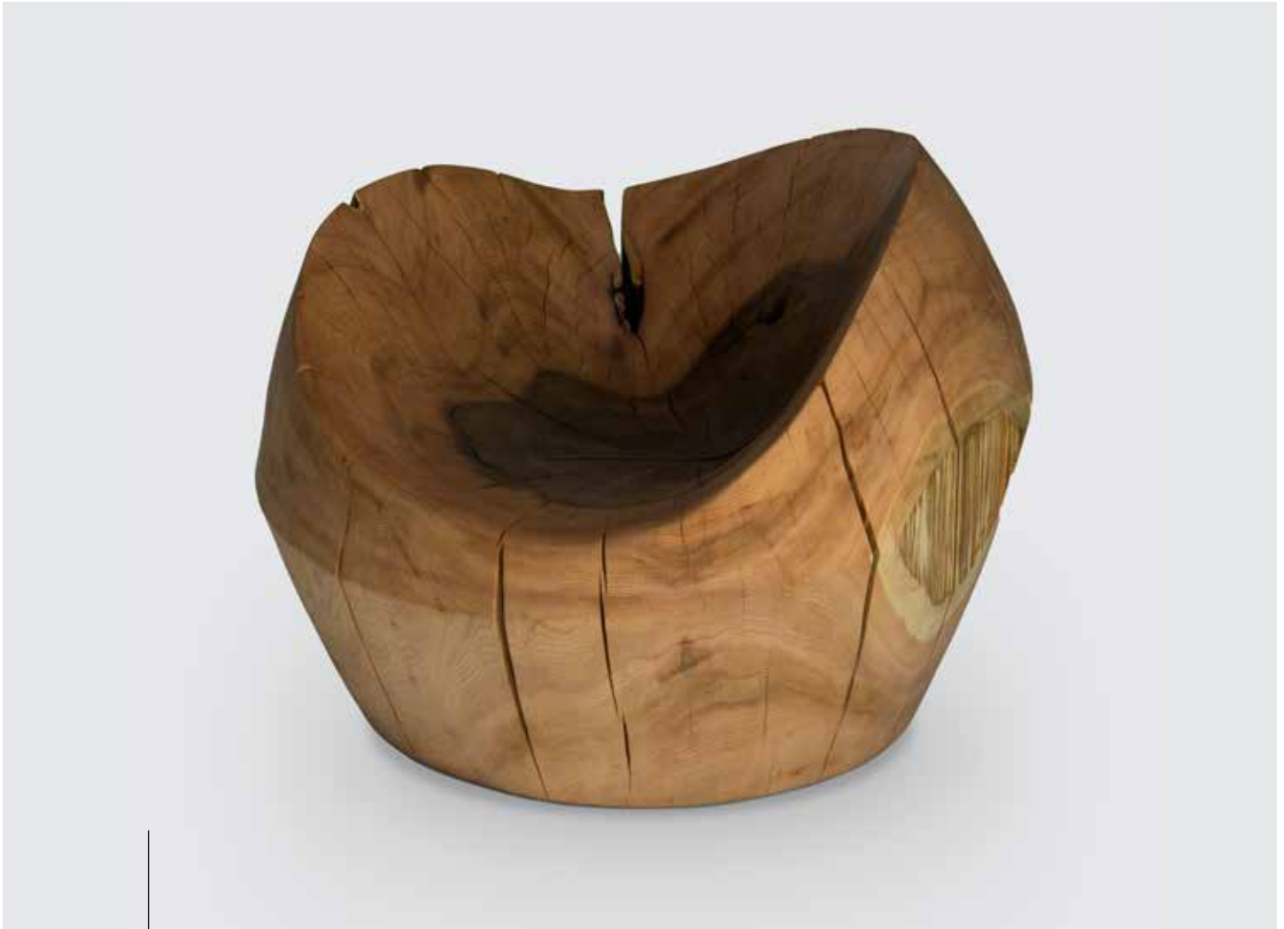
NST-01 | NEST | Western red cedar, Hardwax Oil | 42" Dia. x 30"H