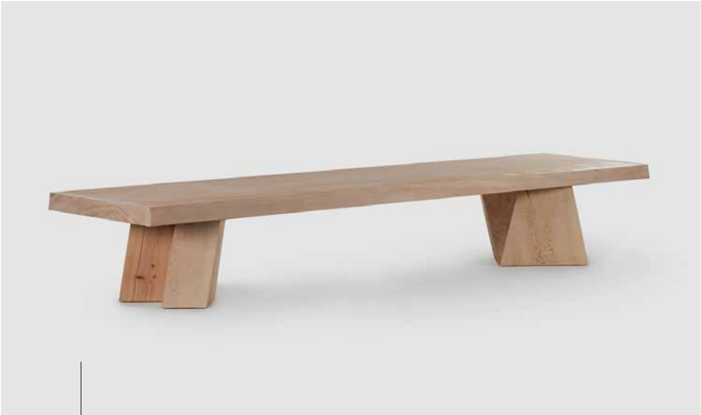
SW-D-1DF | SWEEP BENCH | Douglas fir Slabs | 20"W x 84"L X 17.5"H