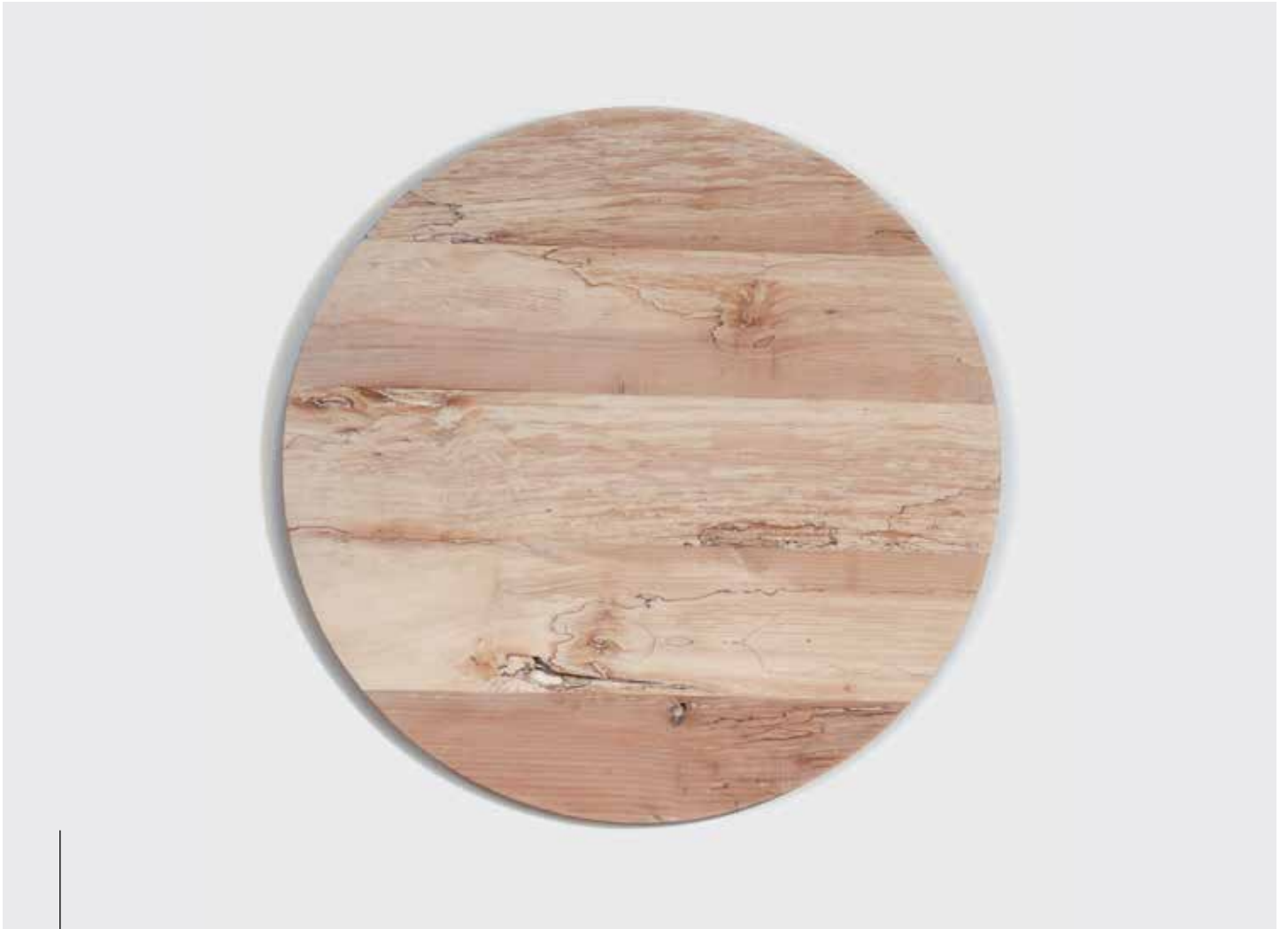
PL-M1 | MAPLE PLATTER | Maple, Soft White Hardwax Oil | 30" Dia. x 2.25"D