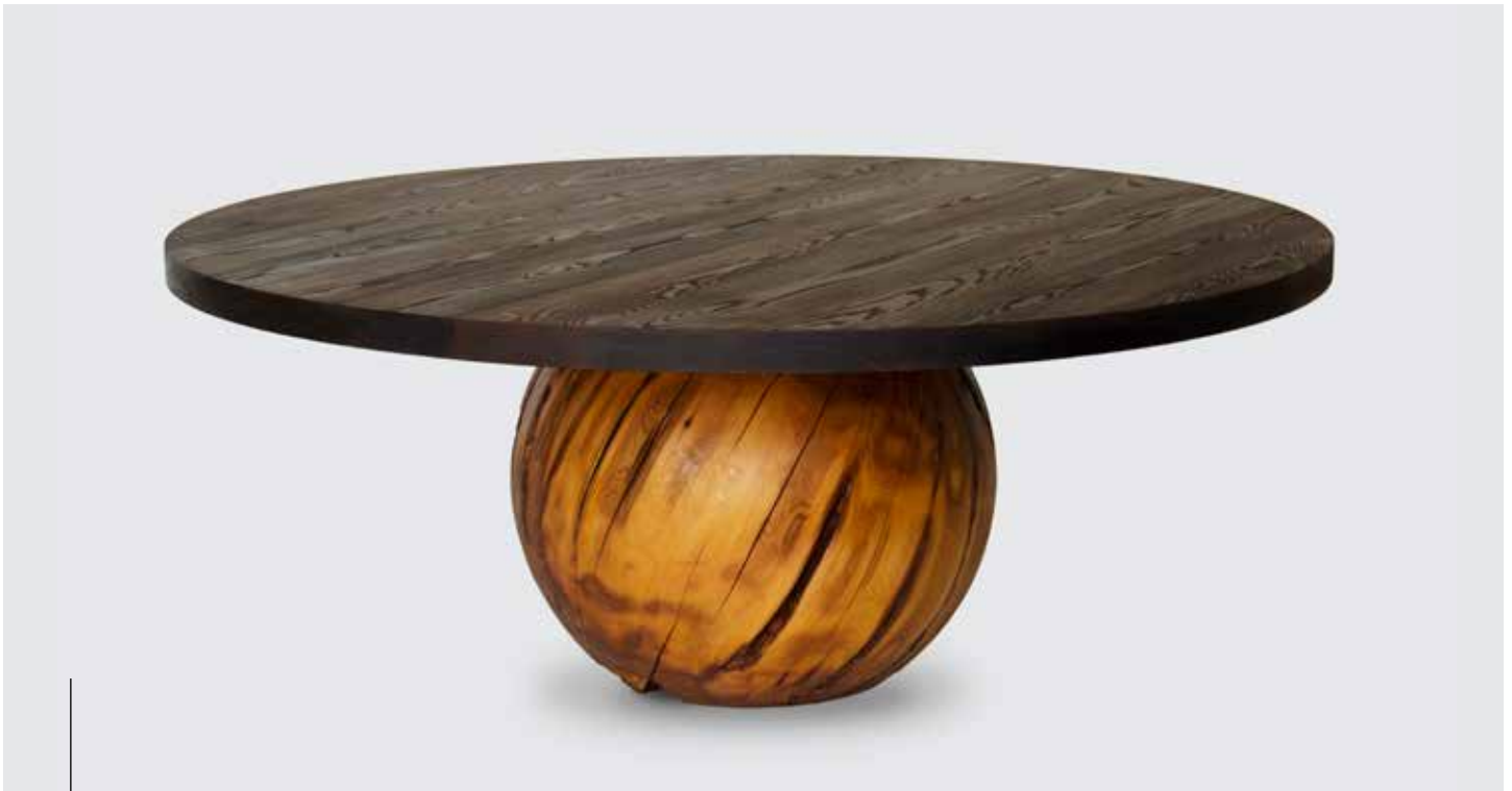
CUSTOM | ISLAND DINING TABLE | Thermalwood Top | 72" Dia. x 29.5"H