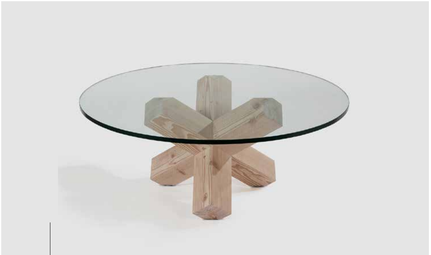
CR-L-S2 | CROWN LOW | Douglas-fir base, Soft White Hardwax Oil | 48" Dia. x 21"H