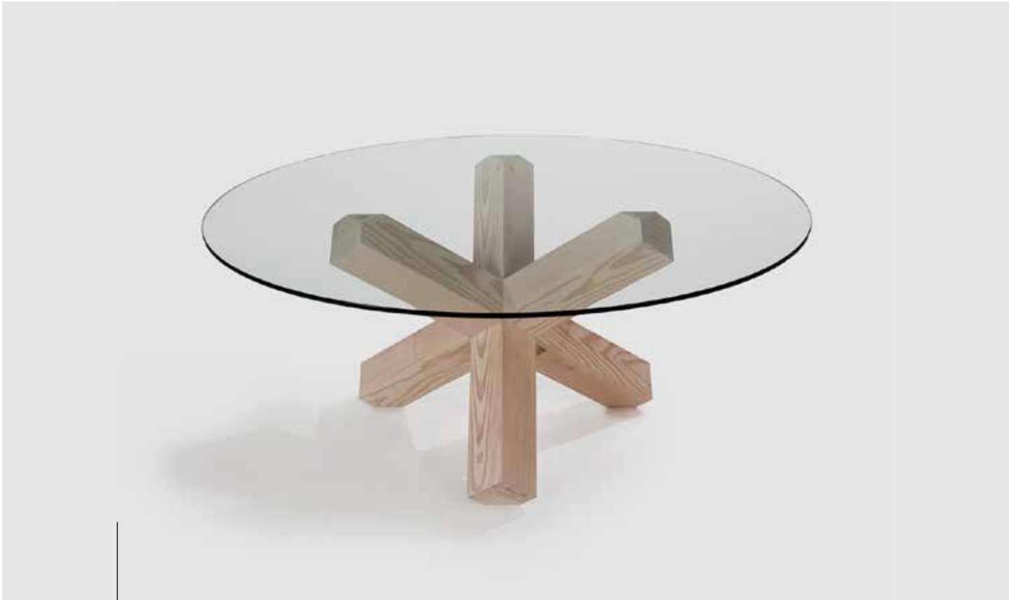
CR-D-1T19 | CROWN DINING | Douglas-fir base, Soft White Hardwax Oil | 60" Dia. x 29.5"H