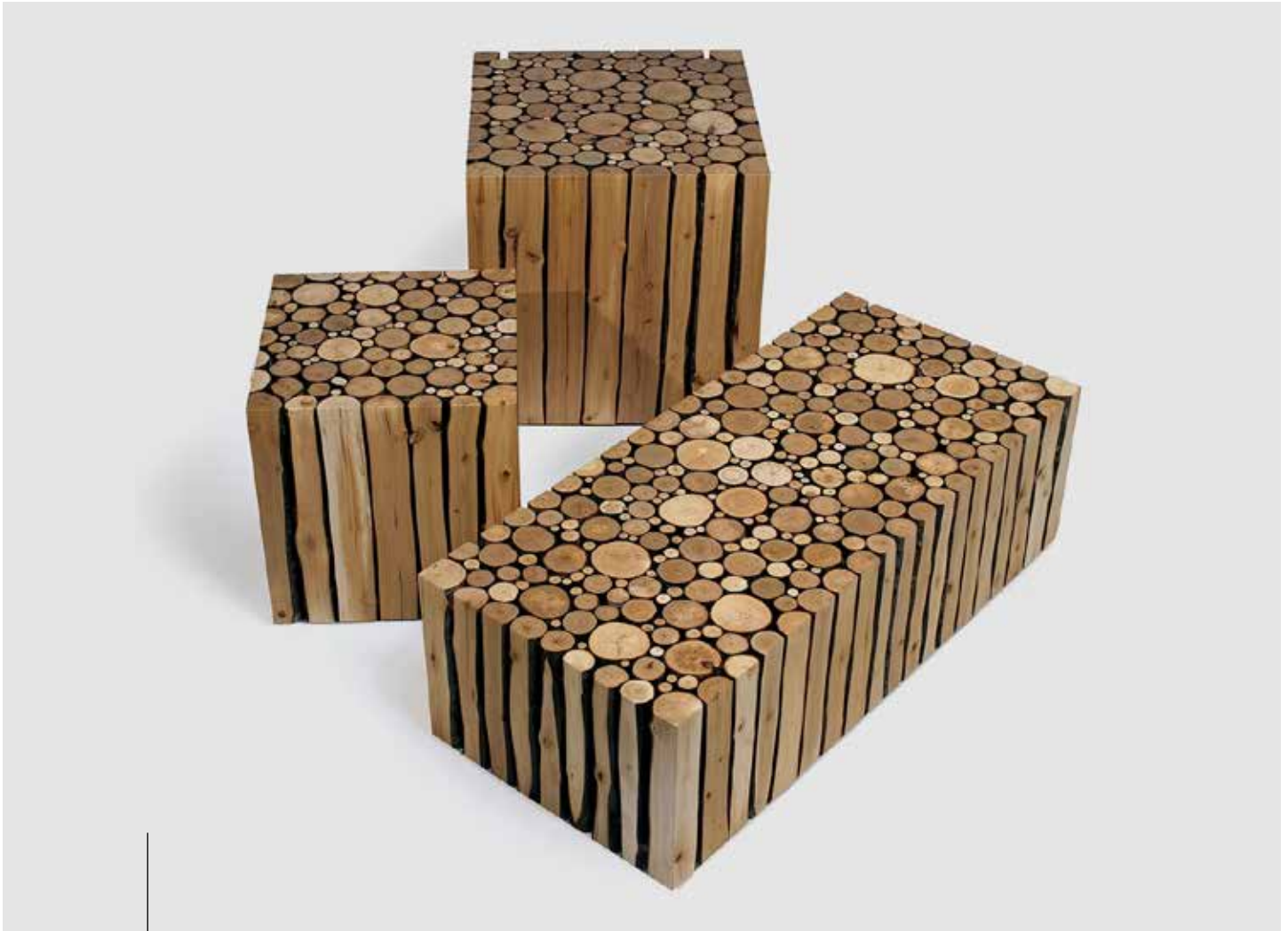
ALDER TABLE | Red Alder, Clear Varnish | Various Sizes