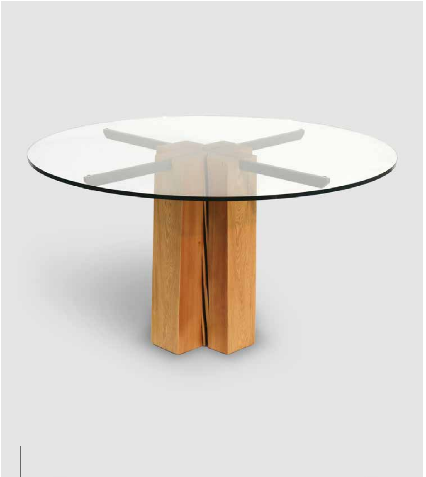
SO-P-3T12 | SOMA PEDESTAL | Douglas fir, Clear Varnish base. Tempered Glass top | 60" Dia x 29.5"H